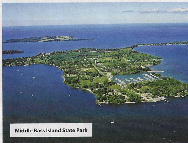
Middle Bass Island State Park

Agricultural roots run deep in this region, including a rich viticultural history. Firelands Winery is one of the oldest, largest, and most award-winning wineries in Ohio, dating back to 1880. Sitting on 41 acres, the winery offers curated wine flights and a small-plate menu, along with year-round tours. For a beer-centric experience, seek out Twin Oast Brewing in Port Clinton. This family-friendly campus is spread out over 60 acres complete with two decorative oasts—European-inspired kilns used for drying hops—along with a locally sourced food menu and live music. Private brewery tours are included with scheduled beer pairing dinners, held on the second Friday of each month.