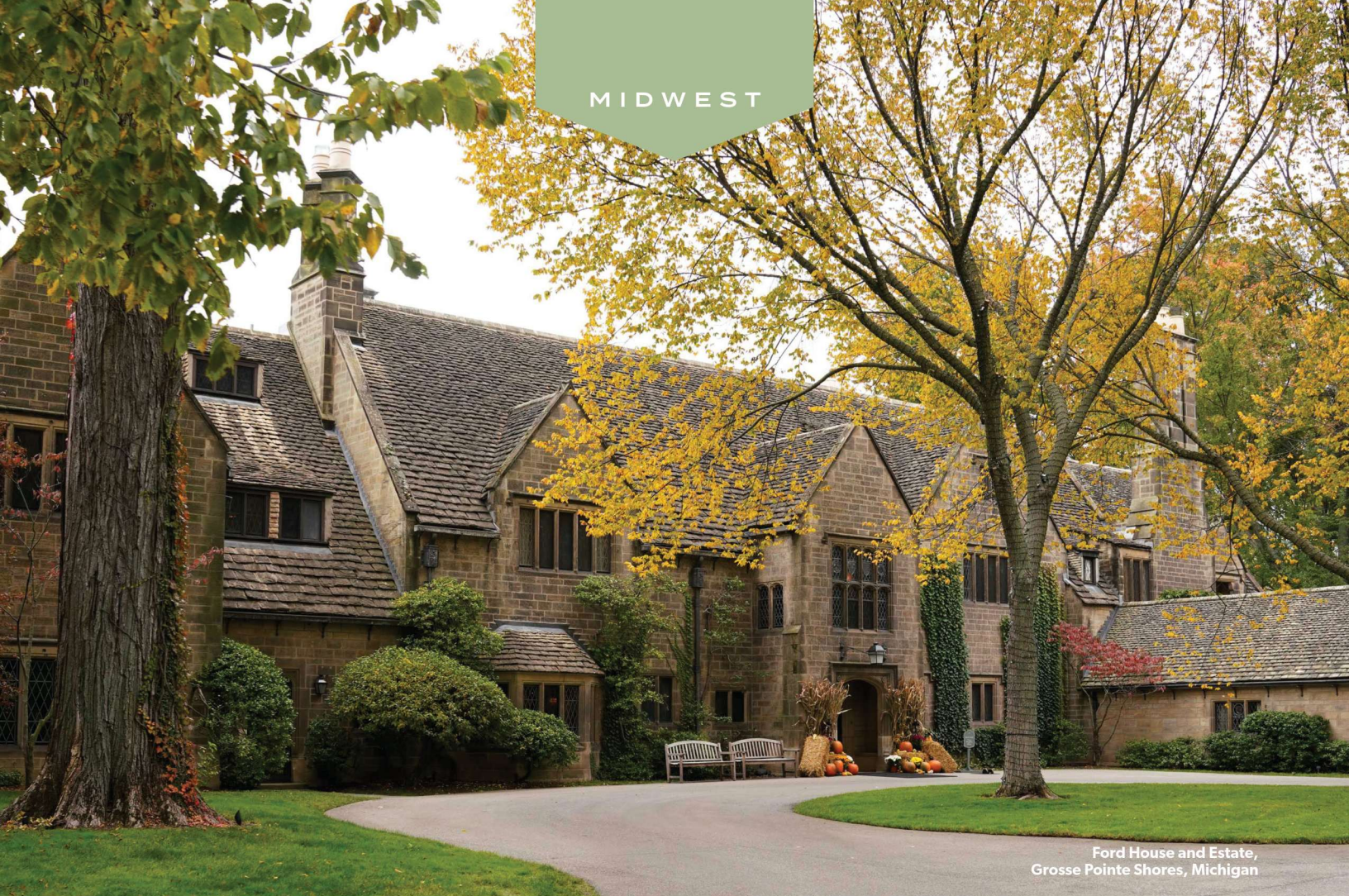
Ford House and Estate, Grosse Pointe Shores, Michigan