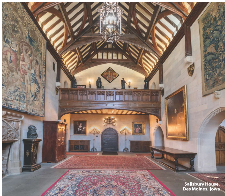
Salisbury House, Des Moines, Iowa

One of Michigan's most esteemed historic dwellings is the former home of Edsel Ford (the only child born to Henry