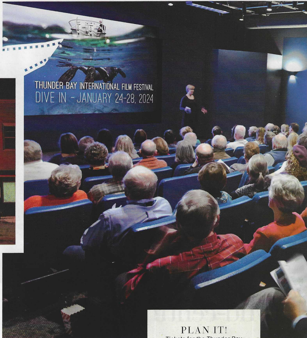
Above: Festival attendees await a film at the Great Lakes Maritime Heritage Center in Alpena. It's also the site of the 2025 opening night gala.