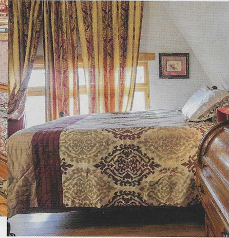
Left to right: Unique guest room adornments await those who book a stay at The Historic Webster House. The Historic Webster House gathering room welcomes visitors with vintage charm and a lovely fireplace. A cozy Henderson Castle guest room.