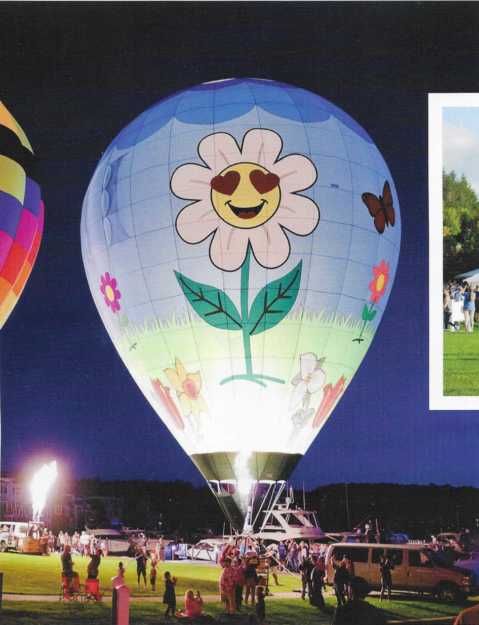
Above: Bay Harbor Village's Sept. 22-24 festival includes two night glow tethered events that may include up to 14 hot-air balloons.

Since he became a licensed aeronaut (pilot) at the age of 21, Jones has clocked in more than 950 flight hours and has founded several ballooning events in Michigan, including Balloons Over Bay Harbor, near Petoskey, first held in 2019.