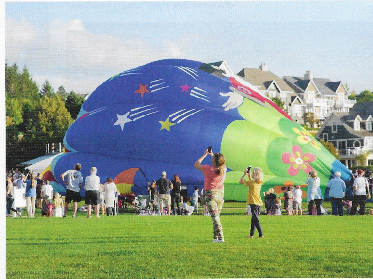
Below: Spectators are encouraged to take photos and videos of the weekend activities that are open to the public.

including the wicker gondola (basket), each nylon or polyester balloon is laid out flat on the ground while the crew opens its skirt (mouth) and uses high-powered fans to fill the envelope (balloon) with air.