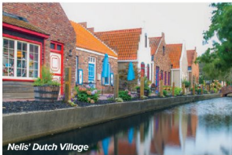
Nelis' Dutch Village