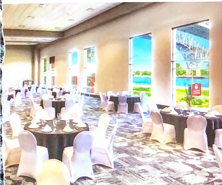
The Blue Water Convention Center in Port Huron sits at the foot of the Blue Water Bridge between Michigan and Ontario, Canada.