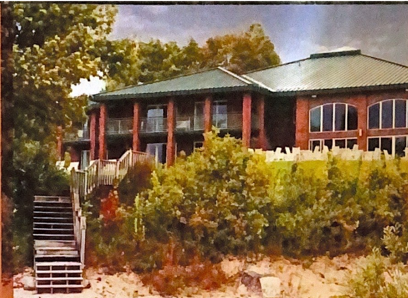
Northport Bay Retreat boasts 340 feet of frontage on Grand Traverse Bay.

Delamar guests will find a welcoming lobby (and a complimentary glass of bubbly upon check-in); heated indoor and outdoor pools (as well as cabanas, a hot tub, and a sauna); a garden terrace featuring fire pits, lush greenery, and lawn games (like bocce and cornhole); on-site yoga classes; e-bike and watercraft rentals; live music (Thursday through Sunday); and upscale dining at Artisan Waterfront Restaurant. Upcoming projects include a full-service spa and private docking facilities for guests arriving by boat. While Delamar offers everything guests need under one roof, the hotel is within walking distance from downtown Traverse City's expanding collection of restaurants, shops, and attractions. delamar.com/traverse-city