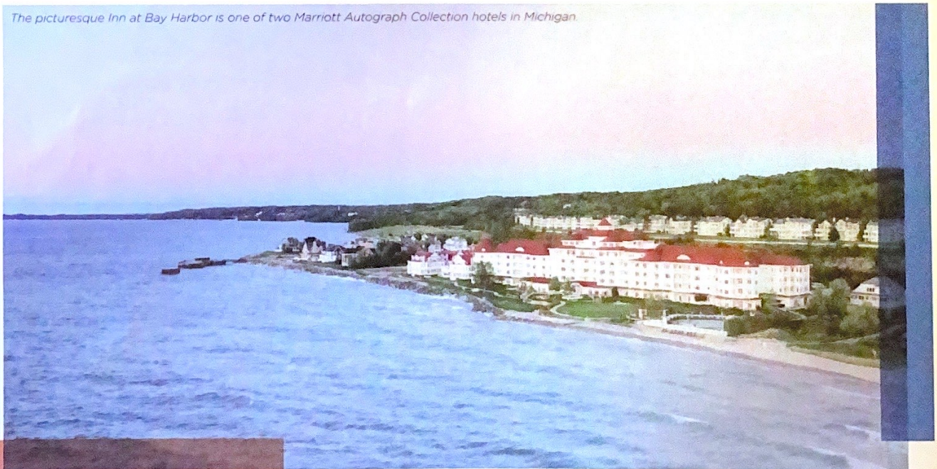
The picturesque Inn at Bay Harbor is one of two Marriott Autograph Collection hotels in Michigan.