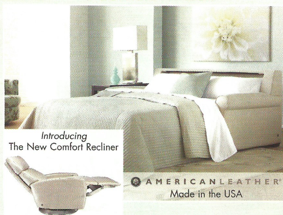
Introducing The New Comfort Recliner